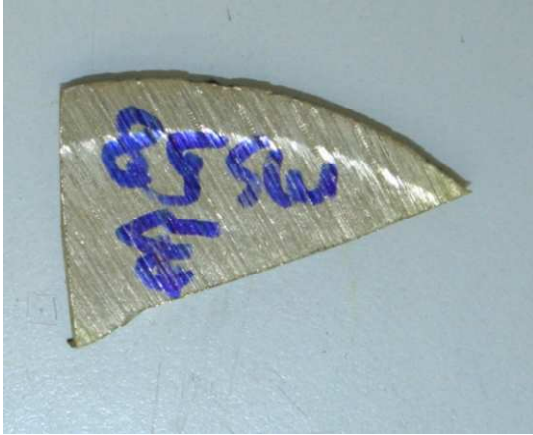
Weight :2.64 g