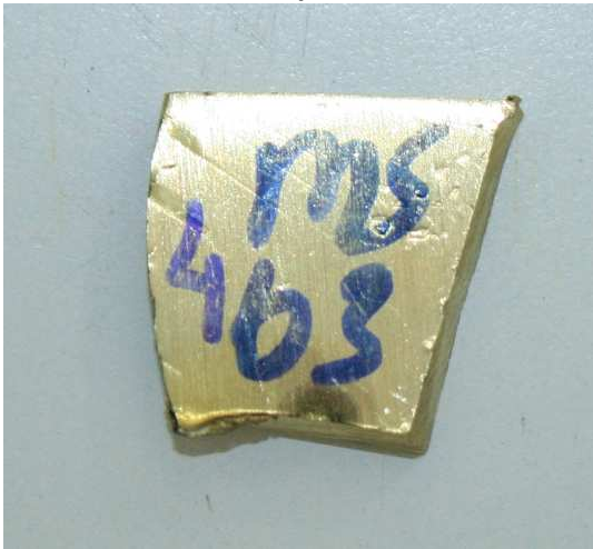
Weight :2.15 g