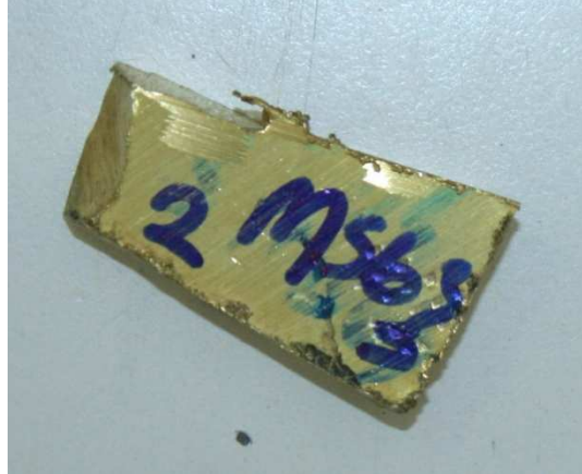
Weight :2.35 g